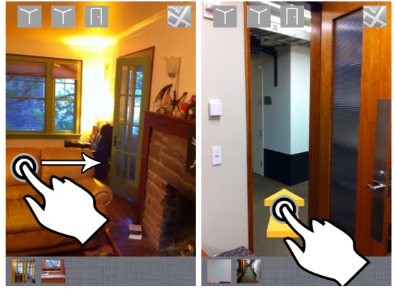
Fig. 7. Browsing with the system proposed in [27]. Left) Looking around the panoramic image. Right) Moving to another room.

One option is to design walkthroughs for synthetic 3D environments manually, as a sort of guided tours, essentially trading freedom of movement for easy-of-use. Since designing such walkthroughs manually is a hard and time-consuming task, automatic techniques have been proposed to explore the environments and find out the space of viable point of views [22]. There are other scenarios where the walkthroughs are simply derived by the acquisition path. A well known