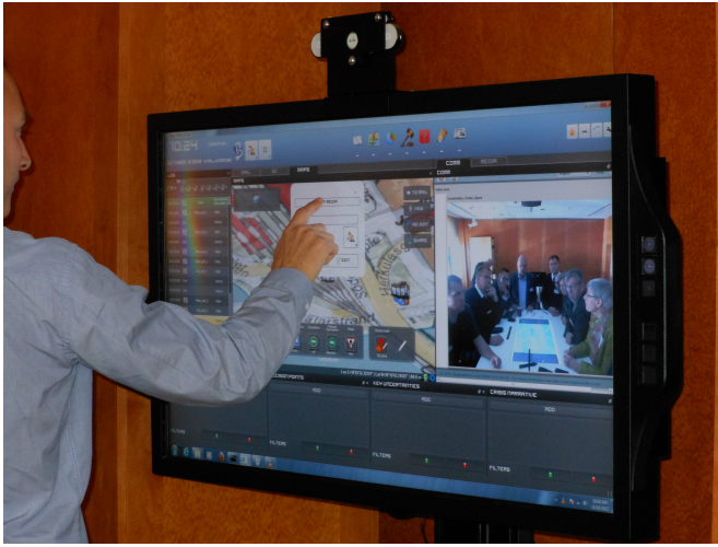
Fig. 2. INDIGO device. Intuitive manipulation of information.

its environment, strategic and operational managers can work together to understand and assess complex situations, which will not just enable shared sense-making but more effective decision-making before and during crisis situations.