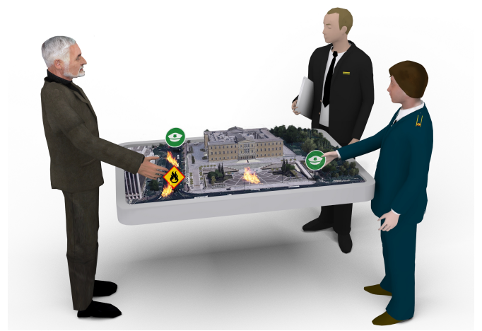
Fig. 3. VASCO Concept. Collaboration and building security knowledge sharing.

A state of the art on crisis management systems [9] and interviews of end users highlighted a need for sharing information, but also highlighted the need to have a system tailored