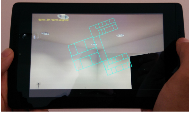
Fig. 6. Indoor capturing. The system to capture building interiors and automatically generate floor plans scaled to their metric dimensions.

used for simulations and interactive applications (see Fig. 6). This kind of multi-room mapping enables non-technical people to create models with enough geometric features for simulations and enough visual information to support location recognition. To capture the scene the user walks between the rooms, ideally drawing an ideal trajectory to the wall upper or lower boundary, just aiming the phone camera at it. During the acquisition a video of the environment is recorded and every frame spatially indexed with the phone’s sensors data, storing thousands of samples for every room. Through a specialized method we merge all individual samples exploiting their strong redundancy to obtain the walls direction and position in metric coordinates, ready for the next floor merging step without any manual editing. The final result is 2D floor plan scaled to real-world metric units, ready for simulation and virtual browsing (see Sec. VI).