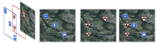
Fig. 5. INDIGO Involvement Organisation Layering. Organisations involved in a crisis management have one or more dedicated layer of information, which can be shared across other organisations. The police layer, in blue, may be combined to firemen information, in red, on top of GIS imagery.

To fit the organisation hierarchy, a group information layer system has been developed. Each organisation is represented as a group, and may add information in this group layer. The organisation may also create subgroups, with a layer of information dedicated to each subgroup. Staff members are associated to groups, and are able to activate the visibility of other groups' layer information. Also, the system enables a user to link information from other groups but also to share information to multiple organisations. This last is necessary for mainly major incidents. As of today, this system proved to