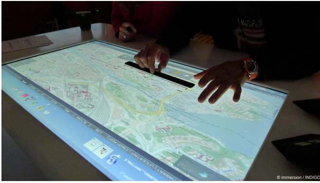
Fig. 4. INDIGO Tangible Ruler. Users are able to measure with a tangible ruler on digital maps. The digital scale around the ruler automatically adapts to the map's scale.

to move the maps with its fingers. This has been achieved with a tactile sensor, where collaborativeness allows multiple users to manipulate the map simultaneously, with a technological limit to 32 points -fingers- for the current devices. As a user would do using a whiteboard, a stylus -a digital pen- has been designed and allows the user to write annotations on the map. Moreover, a physical ruler with digital interaction, called a tangible object, enabled users to measure distances with a real ruler while observing numeric distances displayed on screen. These distances are dynamic and scale simultaneously with the map's scale. The tangible ruler is shown in figure 4.